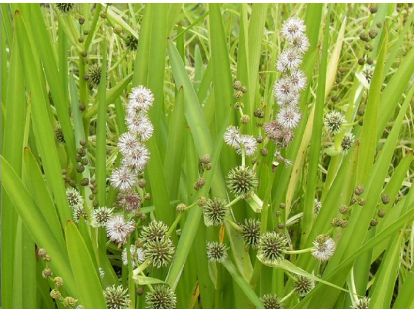
Branched burr weed