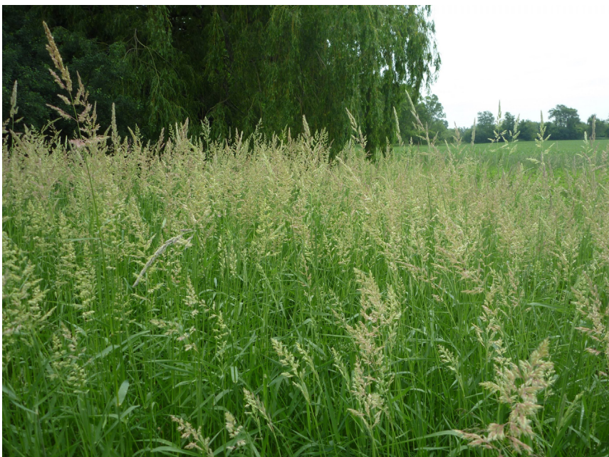
Reed canary grass